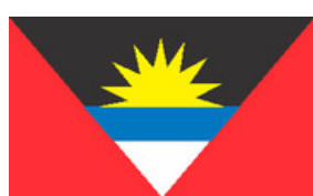
Antigua and Barbuda

National Chapters of the CLDN have been formed in six (6) participating countries: